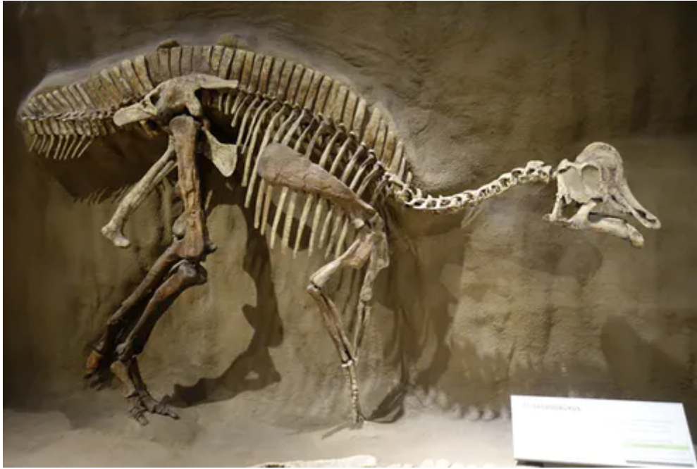
A Hypacrosaurus skeleton at the Royal Tyrrell Museum, Alberta.